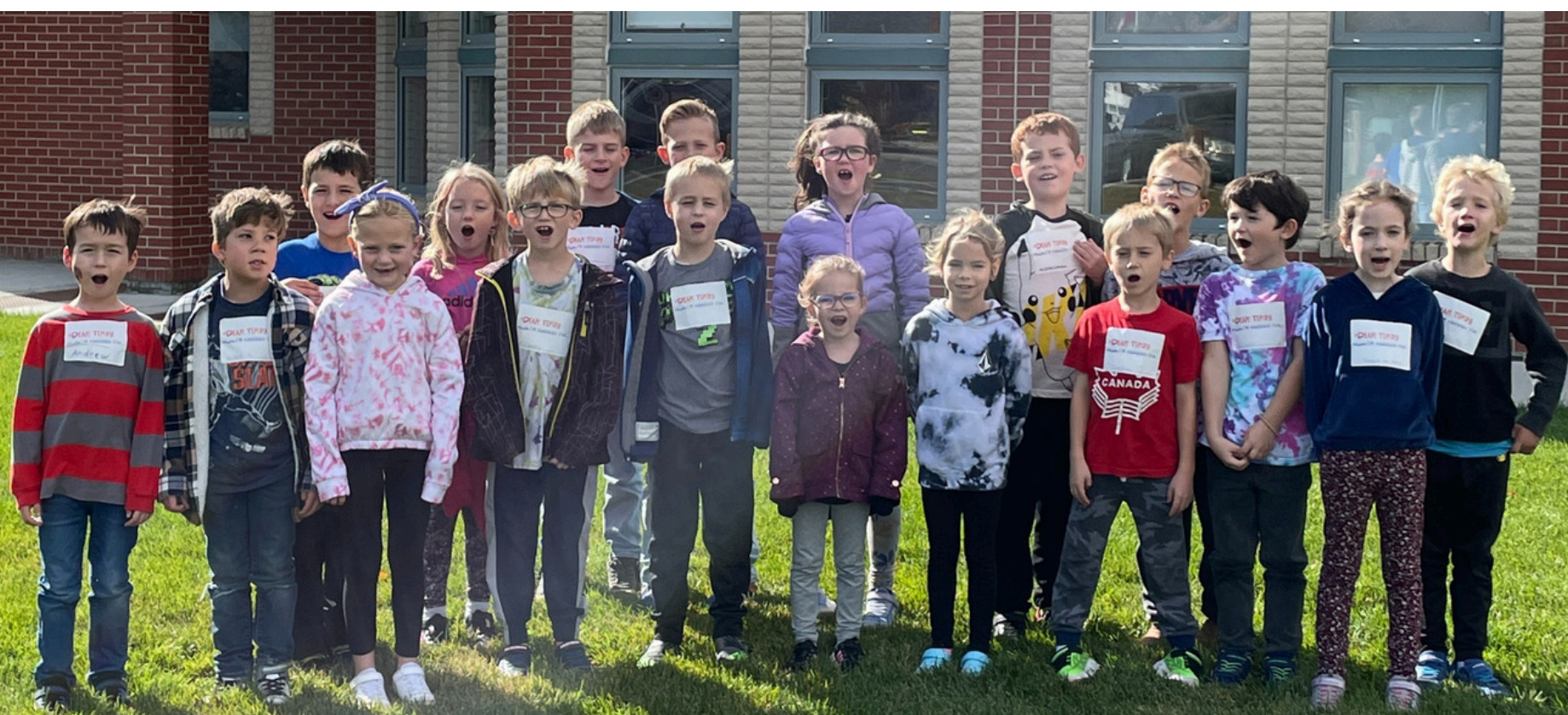
JEES Choir at the Hurricanes Game